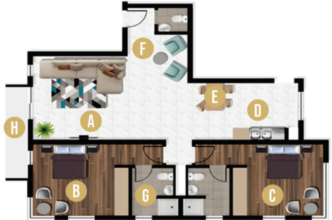
Gabi 2 Bed room Apartment (108 Sqm) Floor Plan

All apartments have ultra modern interior design, Italian kitchen cabinets, fitted Wardrobes, tiled living/dining/Kitchen and toilet spaces, energy saver lighting fixtures, children's playground, Optional fully furnished apartment with sofas, beds, lamps, rugs, dining sets etc. at a bargain price.