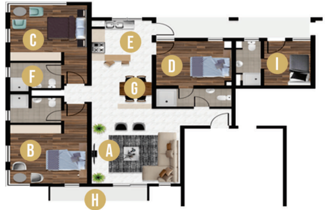
Kechie 3 Bed Room Apartment W/BQ (132Sqm) Floor Plan

All apartments have ultra modern interior design, Italian kitchen cabinets, fitted Wardrobes, tiled living/dining/Kitchen and toilet spaces, energy saver lighting fixtures, children's playground, Optional fully furnished apartment with sofas, beds, lamps, rugs, dining sets etc. at a bargain price.