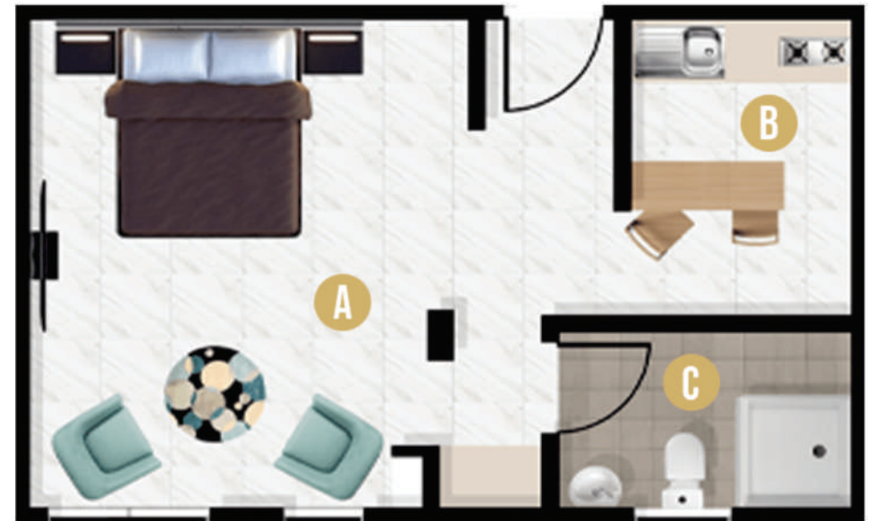
Hibiscus Studio Apartment (38 Sqm) Floor Plan

All apartments have ultra modern interior design, italian kitchen cabinets, fitted Wardrobes, tiled living/dining/Kitchen and toilet spaces, energy saver lighting fixtures, children's playground, Optional fully furnished apartment with sofas, beds, lamps, rugs, dining sets etc. at a bargain price.