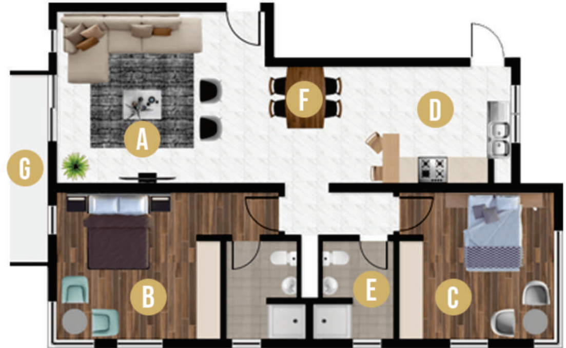
Kemija 2 Bed Room Apartment (114 Sqm) Floor Plan

All apartments have ultra modern interior design, Italian kitchen cabinets, fitted Wardrobes, tiled living/dining/Kitchen and toilet spaces, energy saver lighting fixtures, children's playground, Optional fully furnished apartment with sofas, beds, lamps, rugs, dining sets etc. at a bargain price.